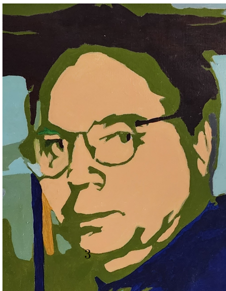
Figure 2: Auther Self Portrait

This book presents SCT from two complementary perspectives: a conceptual exploration written textually and an examination with rigorous mathematical formulation. Experimental predictions include potential gravitational wave distortions, variations in the speed of light in high-density regions, and deviations in nuclear decay rates under varying spacetime compacity conditions. If validated, SCT has the potential to unify the forces of nature, redefine our understanding of gravity, and unlock technological advancements in areas such as gravity-based propulsion (Warp Drive), energy extraction, and spacetime engineering.